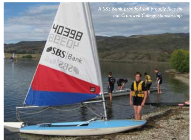
A SBS Bank branded sail proudly flies for our Cromwell College sponsorship.