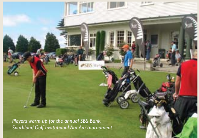
Players warm up for the annual SBS Bank Southland Golf Invitational Am Am tournament.

The team from SBS Bank took charge of keeping all the participants in this year's charity Am Am tournament well fed and raffle tickets were sold for a couple of prime golfing weekends to raise additional funds for the Canterbury Earthquake Appeal. A highlight of the launch evening was having former All Blacks coach Laurie Mains auctioned off to play with the successful Am Am team to add to the Canterbury coffers. The annual tournament hosted all of the country's 15 regional teams, with Auckland coming out top, Manawatu/Wanganui placing second and Southland third.