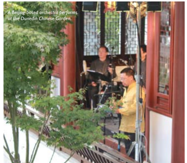
A Beijing-based orchestra performs at the Dunedin Chinese Garden.