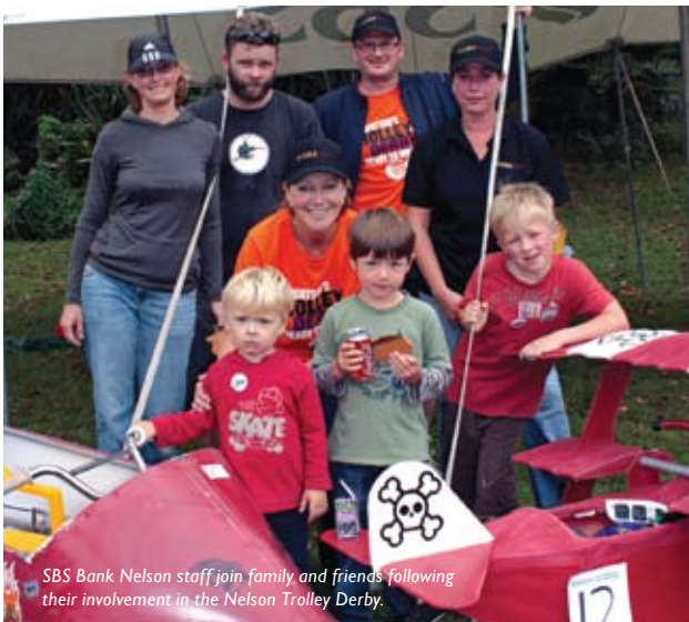
SBS Bank Nelson staff join family and friends following their involvement in the Nelson Trolley Derby.