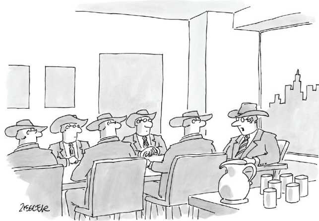
“Someday, gentlemen, I promise you—the heady days of ‘Come a ti yi yippie yippie yay’ will be back.”

the fact that US companies have piled up cash faster compared with interest costs which will set the scene for a surge in mergers and acquisitions (the take over bid by Kraft of Cadbury is the first sign of this trend), especially as investors demand that companies start thinking about M & A to fuel growth. It's a “do deal” market as investors realise